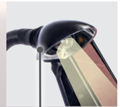
Sanding disc dressing unit