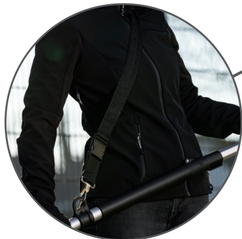
Shoulder strap allows fatigue-free work