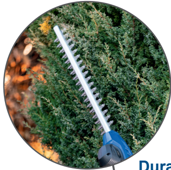
Durable blades made of laser-cut and diamond-ground steel