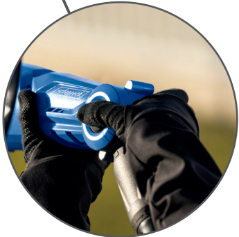
11 positions can be selected