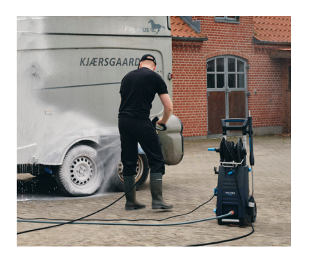
Small hobby farms or animal farms • Cleaning of agricultural equipment and vehicles

The MC1C MC2C is your go-to tool for various cleaning jobs. Both working as a supplement to a more powerful high-pressure washer or as a standalone for small to medium cleaning tasks for: